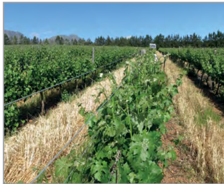
200,000ha of vineyards and orchards are monitored by FruitLook on a weekly basis

The Western Cape of South Africa, including Cape Town, is experiencing a severe drought. With local farmers needing to become water-wise, FruitLook is the tool being used to aid this.